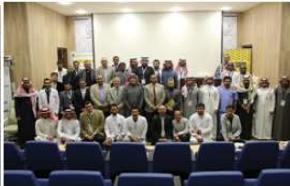
أجتماع الخريجين 23/2019/2